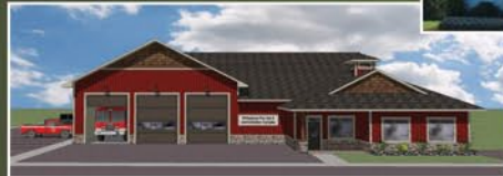
Municipal Office/Fire Dept.